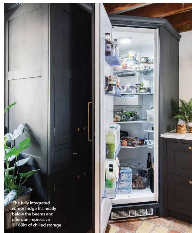
The fully integrated corner fridge fits neatly below the beams and offers an impressive 1,160ltr of chilled storage