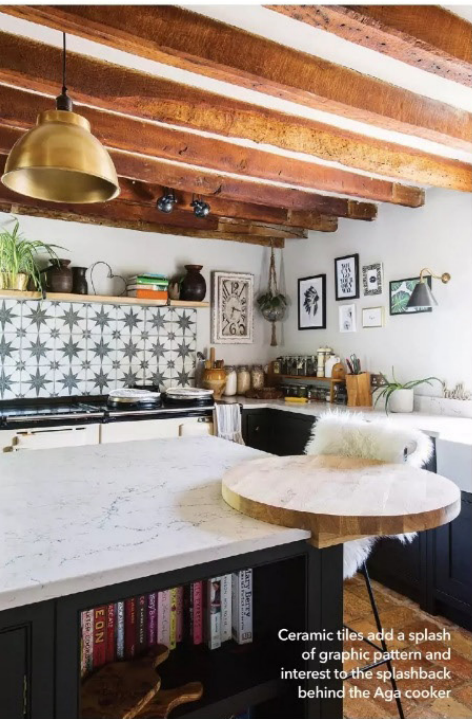
Ceramic tiles add a splash of graphic pattern and interest to the splashback behind the Aga cooker