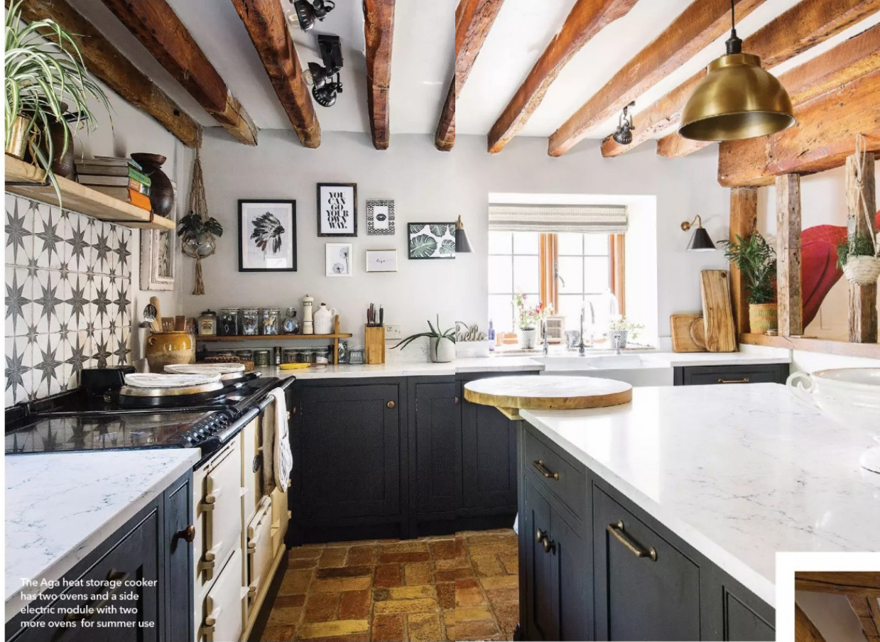
The Aga heat storage cooker has two ovens and a side electric module with two more ovens for summer use