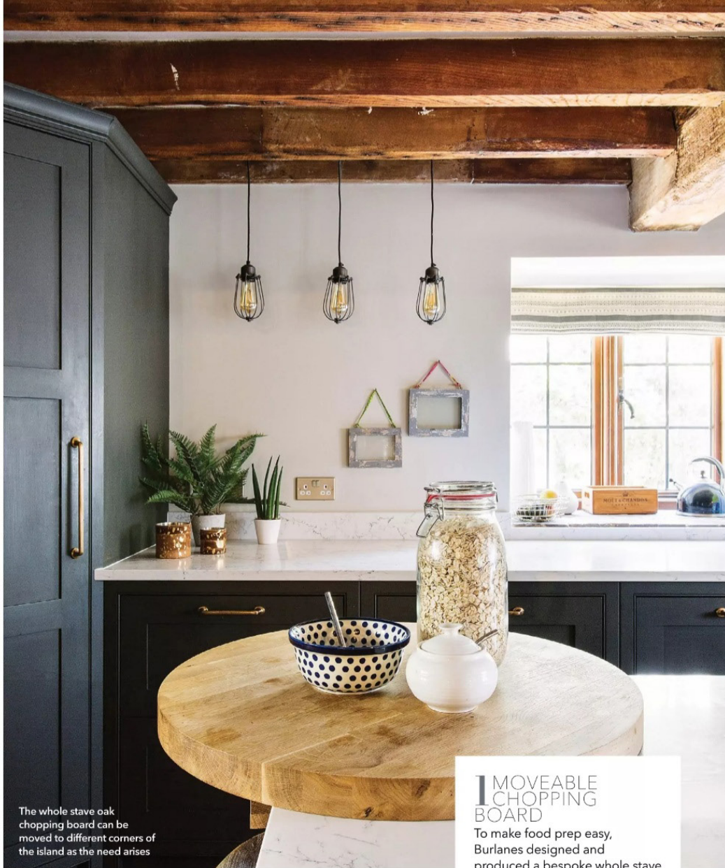
The whole stave oak chopping board can be moved to different corners of the island as the need arises