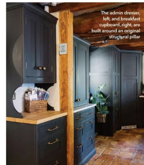
The admin dresser, left, and breakfast cupboard, right, are built around an original structural pillar

Lucy wanted to include an extra-large fridge to suit the size of her family and for entertaining friends, but the original oak ceiling beams limited her options. She felt that a freestanding American-style fridge-freezer would have looked too dominant, while a single column design wouldn't be big enough. The solution was to include a corner model that makes use of the awkward space with almost 1,200 litres of energy-efficient fridge space - about double the amount of an American-style model.